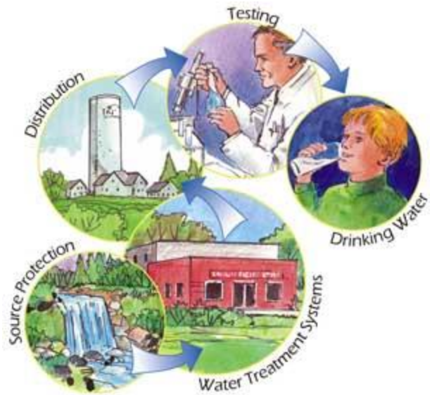
Multi-Barrier Approach to Drinking Water Safety