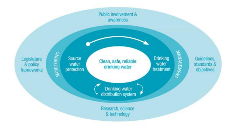
Figure 3: Multiple-Barrier Approach to Drinking Water Protection

As a part of the Walkerton Inquiry, Justice Dennis O'Connor endorsed a "multi-barrier approach" to ensure drinking water safety. This multi-faceted system is a collection of "procedures, processes, and tools that collectively prevent or reduce the contamination of drinking water from source to consumer in order to reduce the risks to public health." (Source: Ontario Ministry of the Environment, 2007; Implementing Quality Management: A Guide for Ontario's Drinking Water Systems)