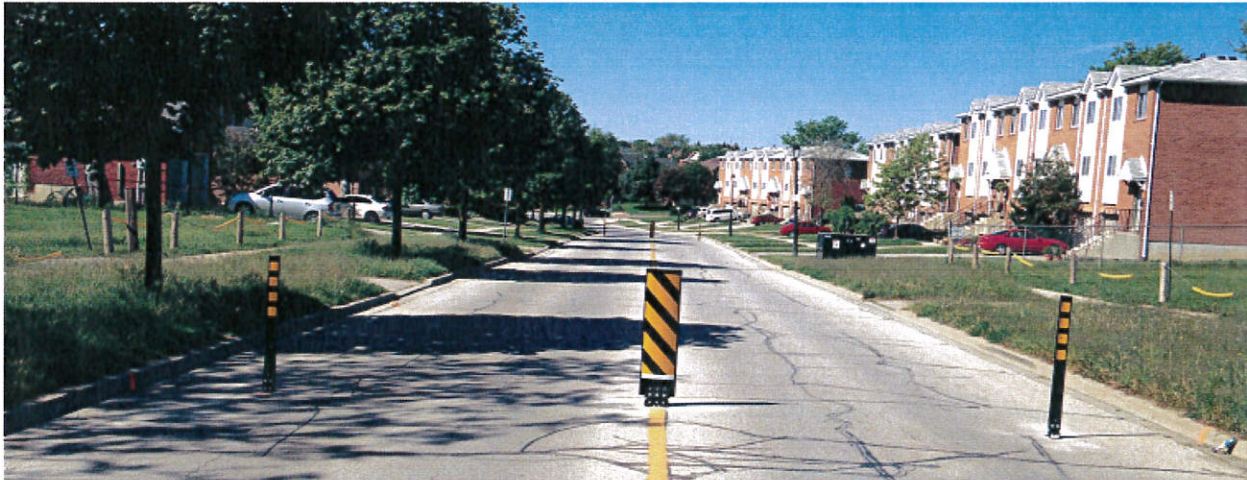
FIGURE 1 Bollard Configuration

Traffic studies were undertaken during the 2016 bollard trial period. Staff confirmed that vehicle operating speeds at the Savage Road sites were reduced by approximately 2 km/h. It was concluded that the bollard trial program was effective at reducing speeds near the bollard locations, but operating speeds were not reduced at locations further away from the bollards. The bollards were reinstalled on the two Savage Road sites in June of 2017, and traffic studies confirmed that traffic speeds decreased again, and this time by 2.4 km/h.