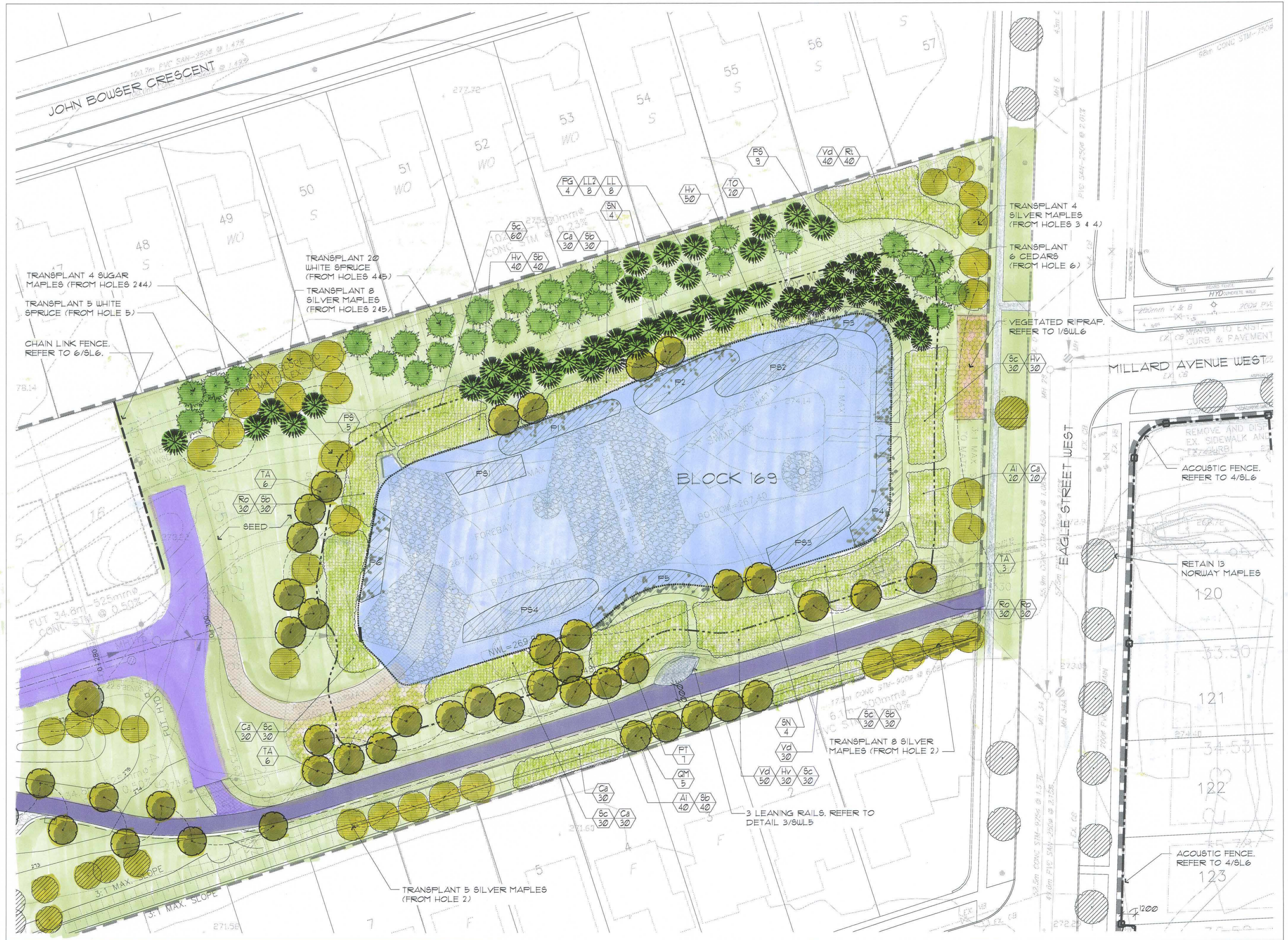
1 SUL.2 LANDSCAPE PLAN SCALE: 1:400